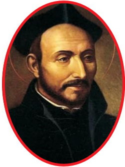
St. Ignatius of Loyola

A Recognised Minority Educational Institution (Reg. No. F-1261/12)