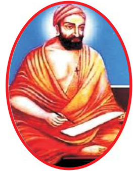
Father Roberto De Nobili