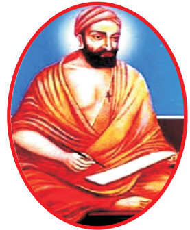
Father Roberto De Nobili