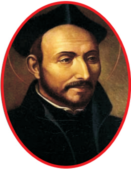
St. Ignatius of Loyola

A Recognised Minority Educational Institution( Reg. No. F-1246/12 )