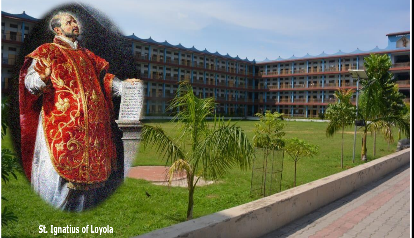
St. Ignatius of Loyola