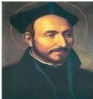
St. Ignatius of Loyola